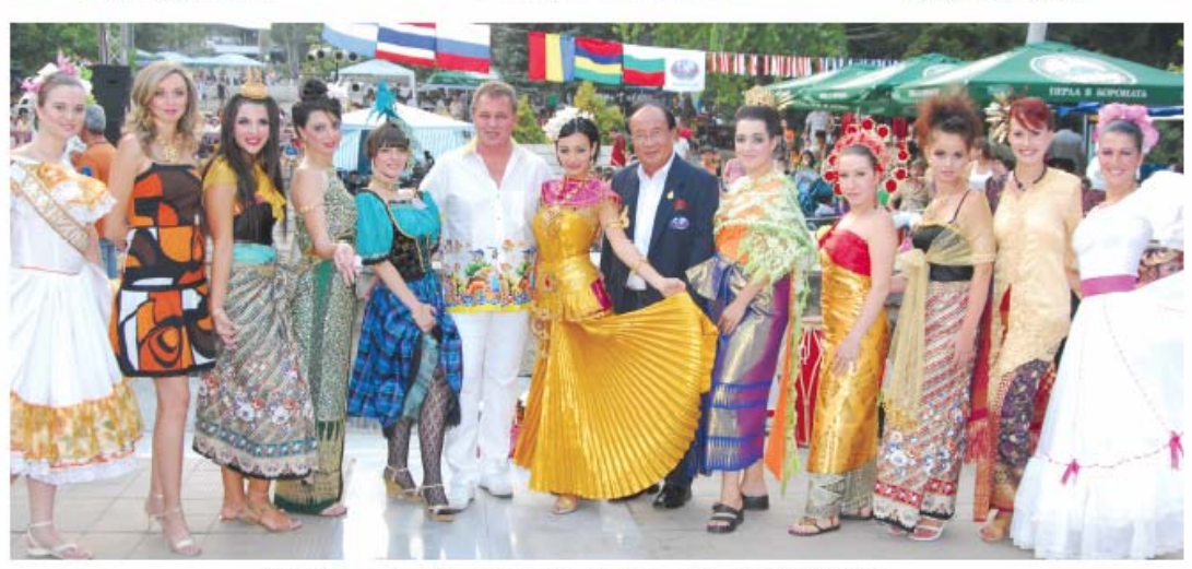
The Team in different National Costumes at 10 IFF 2007