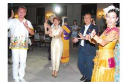
Evening of Thai cuisine