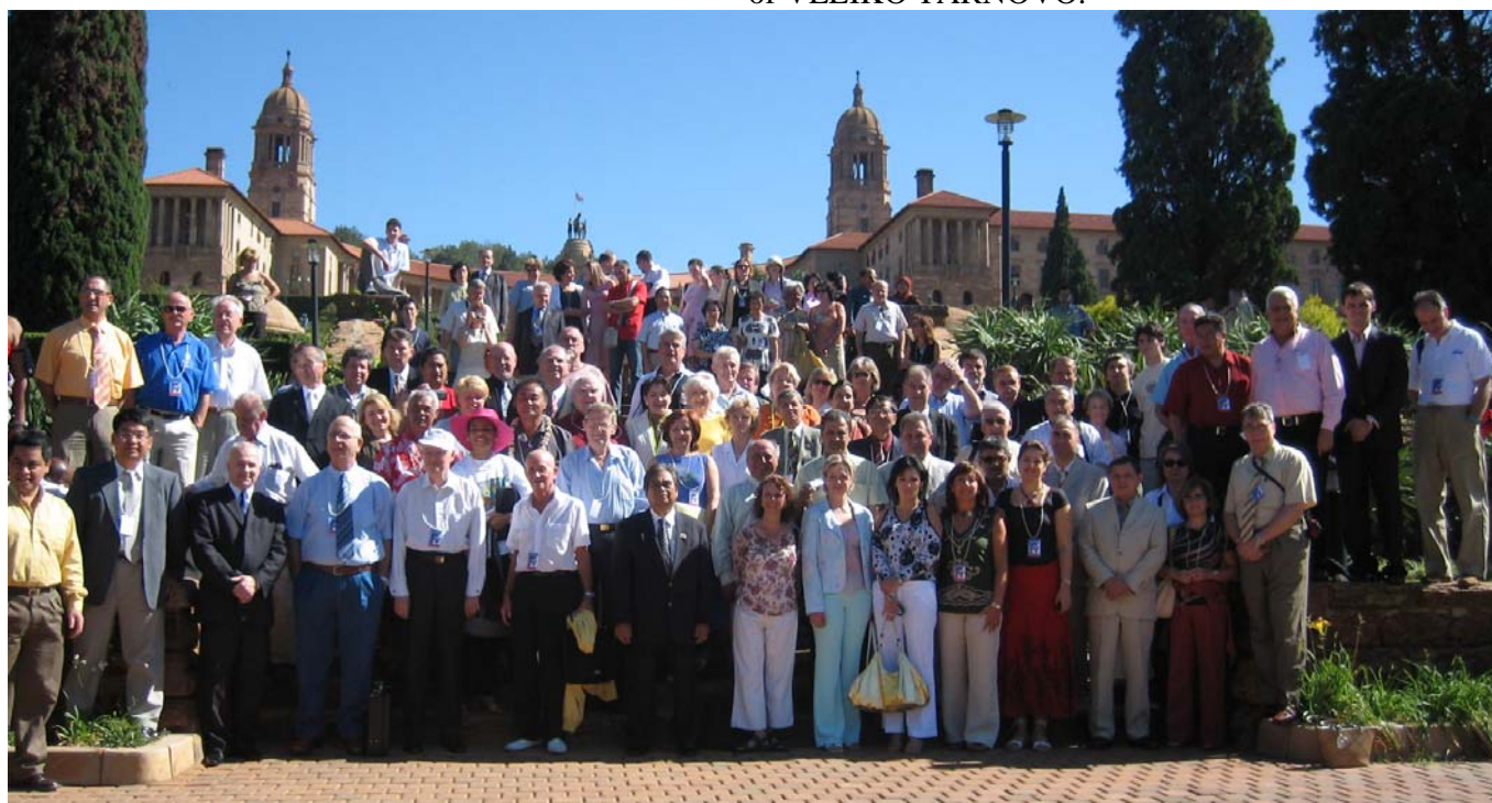
General Assembly in Tshwane, South Africa

Delegate of the National Section of BULGARIA gave a presentation of the 36 th World Congress to be held in BULGARIA from October 27 th to November 4 th 2006, in the city of VELIKO TARNOVO.