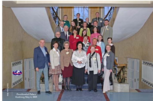
Northern European Sector Meeting in Tallinn (Estonia) – May 2005 Reception at the Presidential Palace.